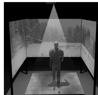
Figure 2: The floor, in the configuration in which it is installed in the rear-projected CAVE-like environment of our lab.

onto real snow. The latter simulation requires motion capture (via a Vicon MCam2 system) of the posture of the feet in order to render the footsteps.